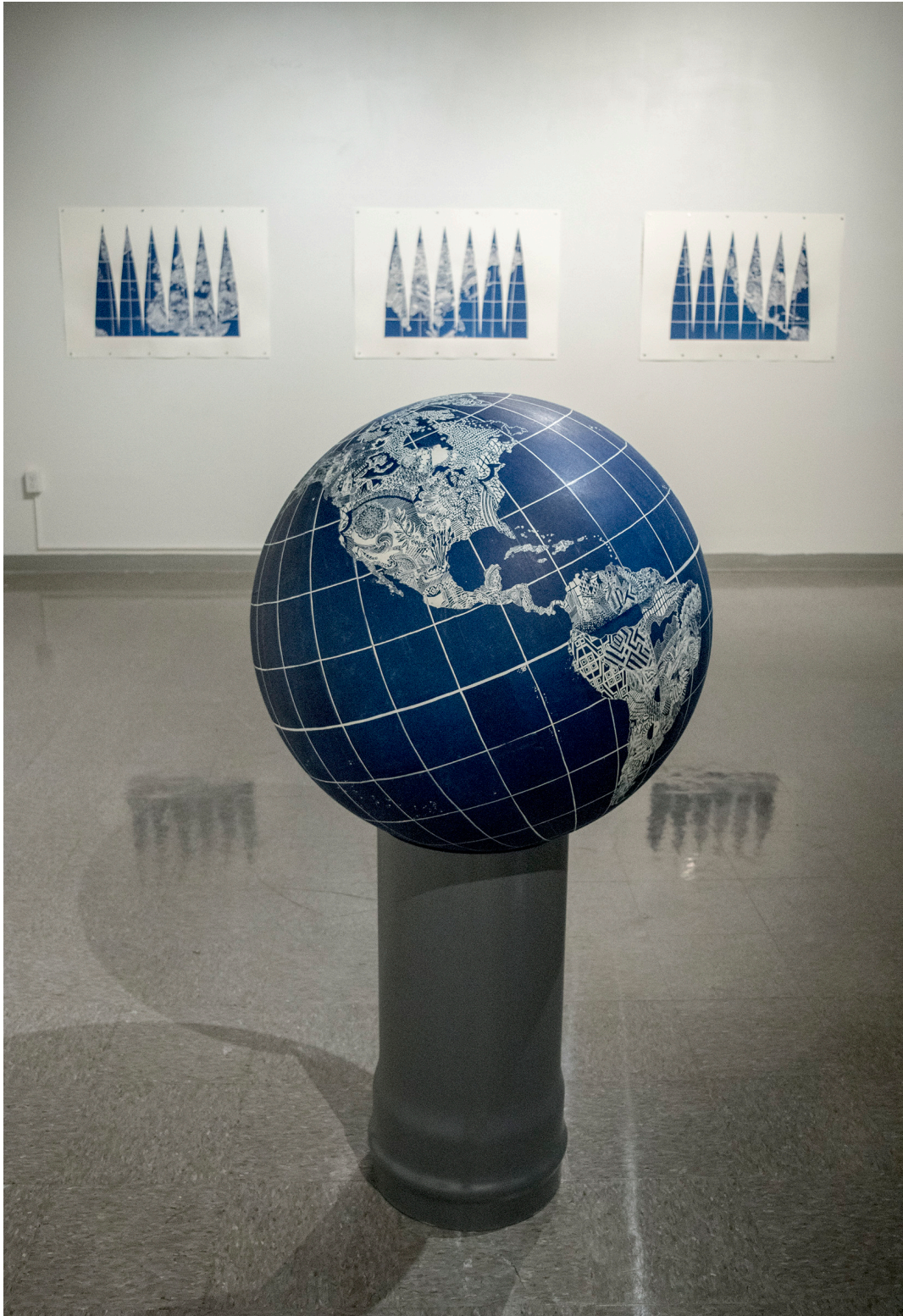
Handheld Utopias Globe, 2017 (detail) Cyanotypes, cast plaster, 64" x 28" x 28"