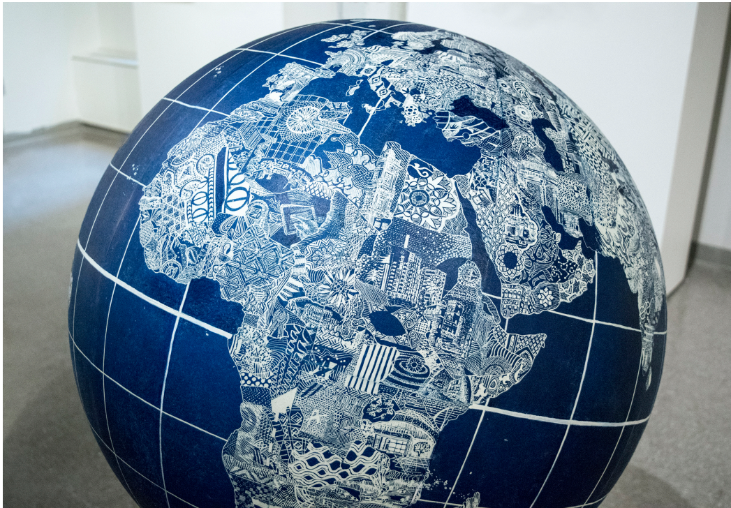
Handheld Utopias Globe , 2017 (detail), Cyanotypes, cast plaster, 64" x 28" x 28"