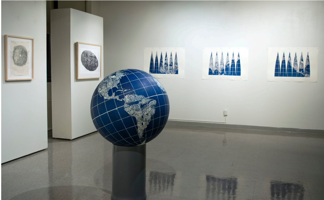
Handheld Utopias Globe , 2017 (from the exhibition Tracing A Line , University of Notre Dame) Cyanotypes, cast plaster, 64" x 28" x 28"